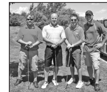
Team Bowmans bulleyes