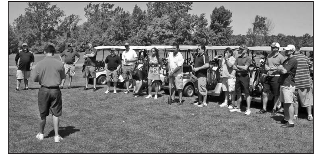
Pre-Tee off pep talk