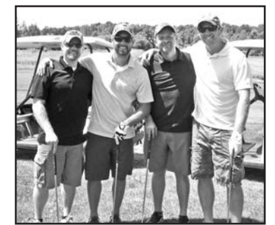
Team Real Tree