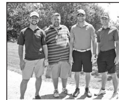
Team Elwood Jordans jammers