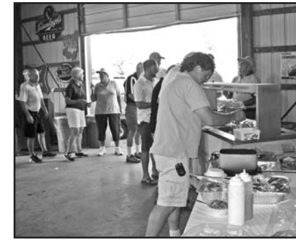
Chicken BBQ Dinner

Any changes to your health insurance such as cancelation, marriage, divorce, birth of a child or the death of anyone covered by the policy must be reported to the Chamber office within 30 days of the event.