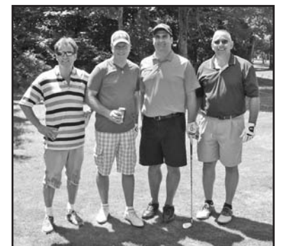
Team Alden Central Schools