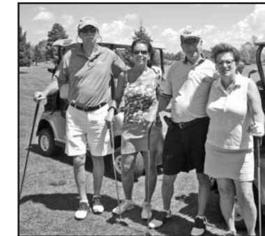
Team Alden State Bank