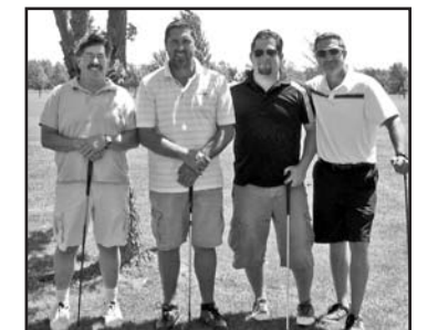
Team CMK Builders