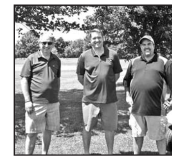
Team Mass Mutual