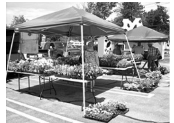
2010 Farmers Market

It's hard to believe that this is our 9th season. Vendors, volunteers, customers and entertainers are all keys to our success. Come join all your old and new friends at the Alden Farmers Market.