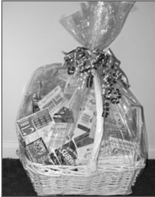
Farmer's Market Basket from 2009