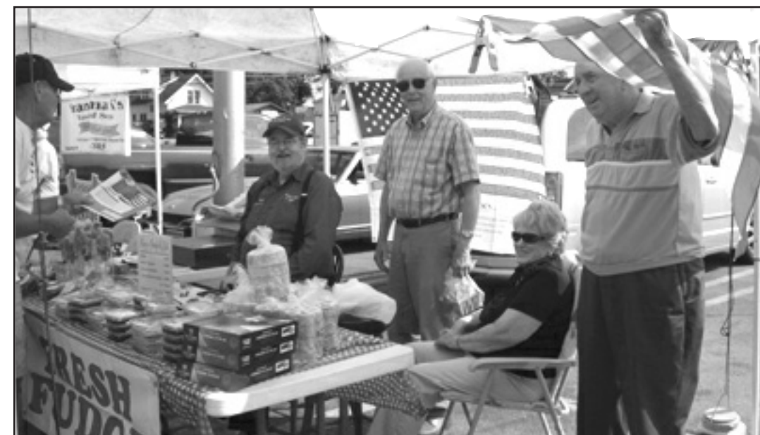
Henry's Candy & Gifts sells fudge and candy plus Crystal Beach waffles and suckers at the Alden Farmer's Market.