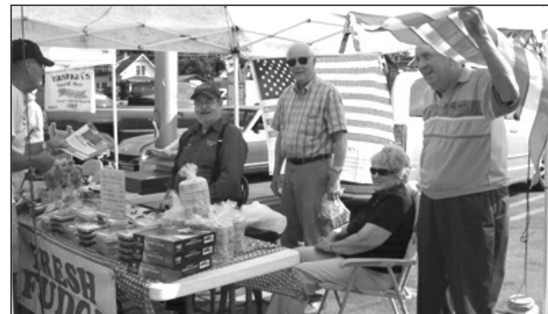
Henry's Candy & Gifts sells fudge and candy plus Crystal Beach waffles and suckers at the Alden Farmer's Market.